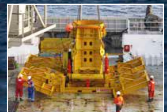
36" Fast Frame

FPSO oil production vessel and supply ship in deep water.