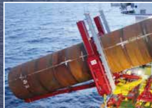
Pile upending and positioning frame

IHC IQIP has been active in the offshore wind market from the very beginning and is presently a market leader in pile driving, noise reduction and pile handling and guiding for the installation of monopiles, jackets and tripods for wind farms and substations. With our big hammers, sleeves and handling equipment, we are able to install the biggest monopile in the market, the XXL monopile. Our Noise Mitigation System (NMS) is unique and the only proven technology for reducing noise during foundation installation. Besides installing turbine foundations, our equipment is also used for installation and maintenance of turbines.