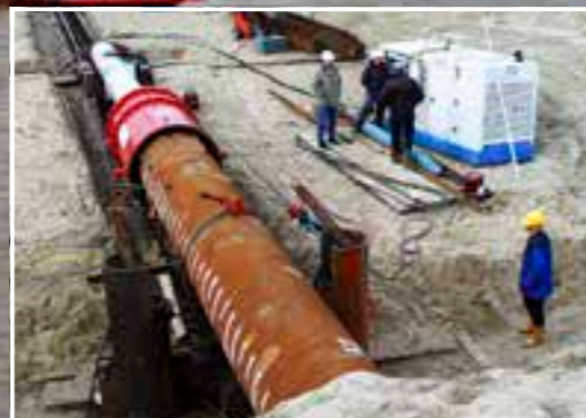
Horizontal pile driving

In the dynamic and global market of onshore coastal and civil works, IHC IQIP holds a unique position as the supplier of piling and drilling equipment. Due to increased urbanization, there is less space and more environmental legislation. Larger, higher and unconventional structures require more complex foundations. Our equipment, such as our Hydrohammer, can even be used horizontally and allows working under the most severe circumstances to install foundations for buildings, container terminals, bridges, viaducts, jetty and mooring posts.