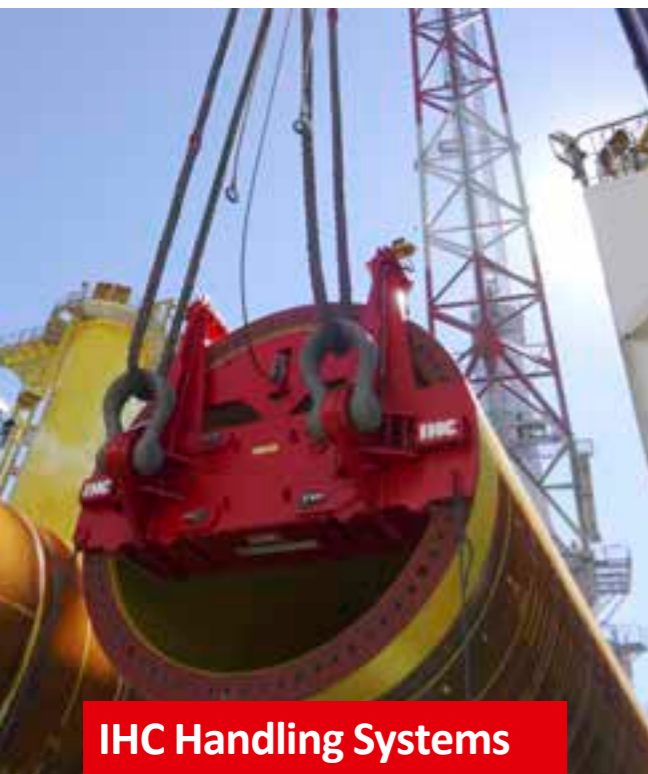
IHC Handling Systems