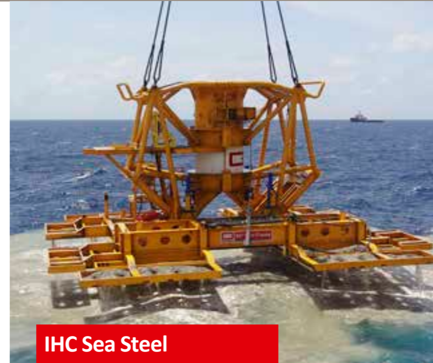
IHC Sea Steel

Incorporated in the 90s, IHC Sea Steel UK was involved in projects providing onboard site representation and technical assistance for the installation of riser base piles, as well as design development of suction riser bases. Since that time Sea Steel has been involved in many projects predominantly in Oil and Gas but also Offshore Wind, designing and supplying rental pile guide