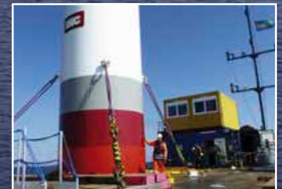
Noise Mitigation System

London Array, world's largest offshore wind farm in the Thames estuary.