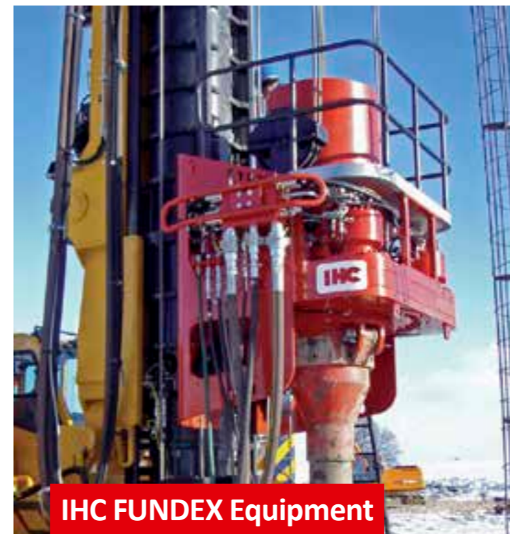
IHC FUNDEX Equipment

The origins of IHC FUNDEX Equipment date back to the late sixties, when it carried out piling and drilling jobs globally in the onshore market for foundation construction. IHC FUNDEX Equipment-engineers have been creating new and innovative products and improvements which contribute to a higher