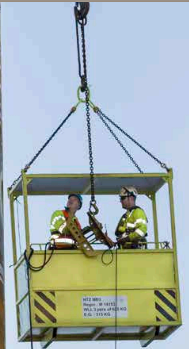
Ramming of a monopile at the Butendiek wind farm.

Setting the market standard by constantly reinventing our equipment