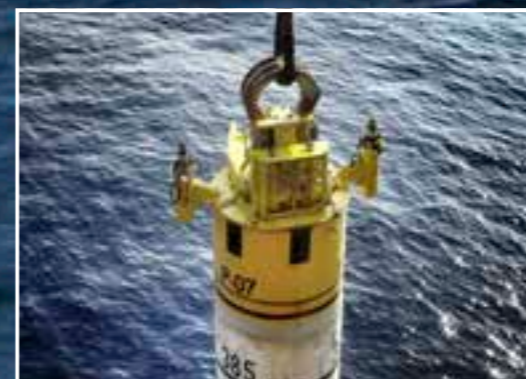
Deep water Internal Lifting Tool (ILT)